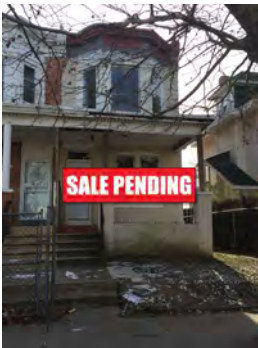
2904 Carman St. 3 Bed/1.5 Bath 1,323 sq. ft. East Camden