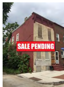
721 Clinton Ave. 3 Bed/1.5 Bath 1,350 sq. ft. Cooper Plaza