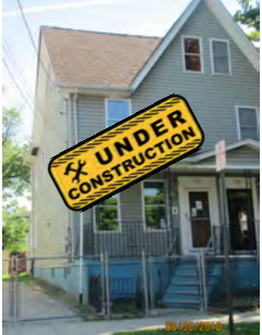
222 S. 32nd St. 3 Bed/1.5 Bath 1,248 sq. ft. East Camden