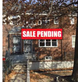
528 Randolph St. 3 Bed/1.5 Bath 1,166 sq. ft. East Camden