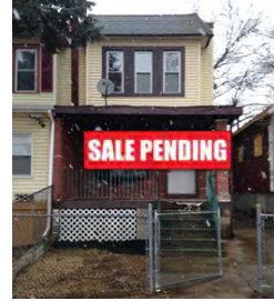
334 No. 40th St. 3 Bed/1.5 Bath 1,190 sq. ft. East Camden