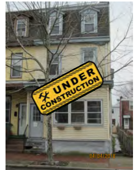
228 Market St. 5 Bed/1.5 Bath 2,076 sq. ft. Gloucester City