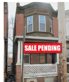
556 Newton Ave. 3 Bed/1.5 Bath 1,372 sq. ft. Cooper Plaza