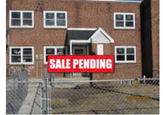
504 Rand St. 3 Bed/1.5 Bath 1,404 sq. ft. East Camden