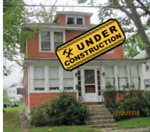
211 N 42nd St. 3 Bed/1.5 Bath 1,476 sq. ft. East Camden