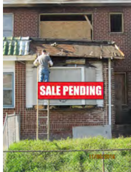
2621 Baird Blvd. 3 Bed/1.5 Bath 1,525 sq. ft. East Camden