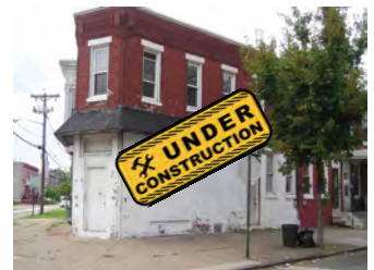
466 Trenton Ave. 3 Bed/2.5 Bath 1,800 sq. ft. Cooper Plaza

Call today for pricing and availability!