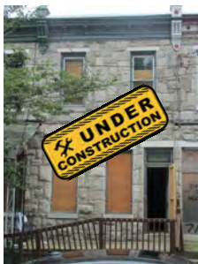
714 Royden Ave. 3 Bed/1.5 Bath 1,290 sq. ft. Cooper Plaza