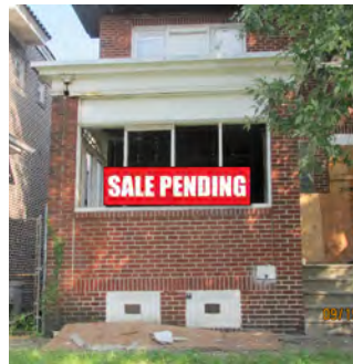
2568 Baird Blvd. 4 Bed/2.5 Bath 2,500 sq. ft. East Camden