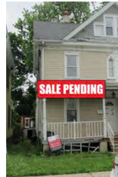
66 E. Centre St. 4 Bed/1.5 Bath 1,574 sq. ft. Woodbury