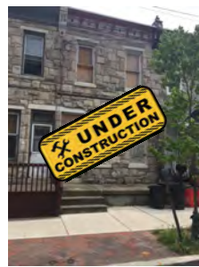
712 Royden Ave. 3 Bed/1.5 Bath 1,290 sq. ft. Cooper Plaza