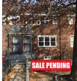
528 Randolph St. 3 Bed/1.5 Bath 1,166 sq. ft. East Camden