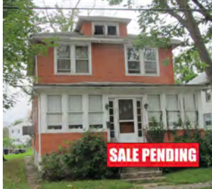
211 N 42nd St. 3 Bed/1.5 Bath 1,476 sq. ft. East Camden