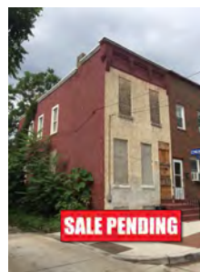
721 Clinton Ave. 3 Bed/1.5 Bath 1,350 sq. ft. Cooper Plaza