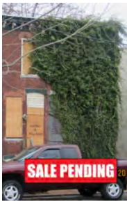
515 S 7th St 2 Bed/2 Bath 990 sq. ft. Cooper Plaza