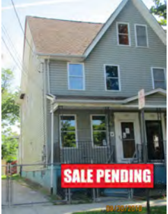
222 S. 32nd St. 3 Bed/1.5 Bath 1,248 sq. ft. East Camden