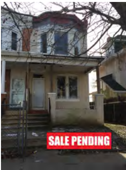
2904 Carman St. 3 Bed/1.5 Bath 1,323 sq. ft. East Camden