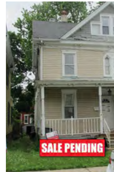
66 E. Centre St. 4 Bed/1.5 Bath 1,574 sq. ft. Woodbury