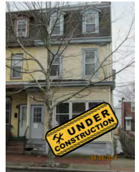
228 Market St. 5 Bed/1.5 Bath 2,076 sq. ft. Gloucester City