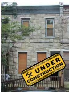
714 Royden Ave. 3 Bed/1.5 Bath 1,290 sq. ft. Cooper Plaza