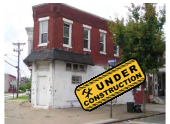
466 Trenton Ave. 3 Bed/2.5 Bath 1,800 sq. ft. Cooper Plaza

Call today for pricing and availability!