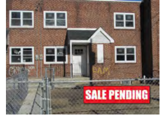
504 Rand St. 3 Bed/1.5 Bath 1,404 sq. ft. East Camden