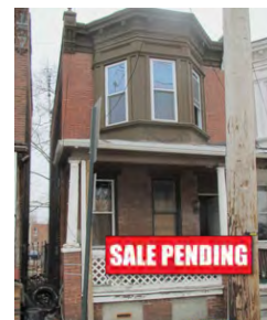
556 Newton Ave. 3 Bed/1.5 Bath 1,372 sq. ft. Cooper Plaza