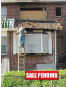
2621 Baird Blvd. 3 Bed/1.5 Bath 1,525 sq. ft. East Camden