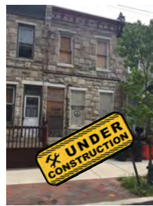
712 Royden Ave. 3 Bed/1.5 Bath 1,290 sq. ft. Cooper Plaza