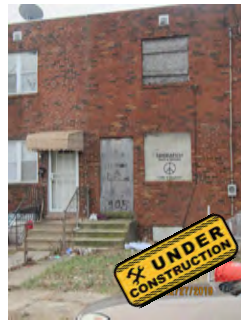
905 N. 22nd St. 3 Bed/1.5 Bath 1,155 sq. ft. Cramer Hill