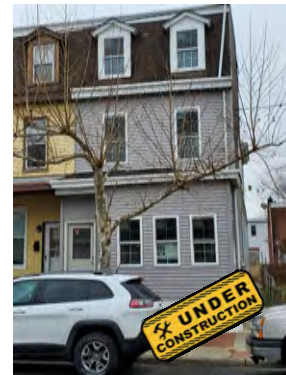
228 Market St. 5 Bed/1.5 Bath 2,076 sq. ft. Gloucester City