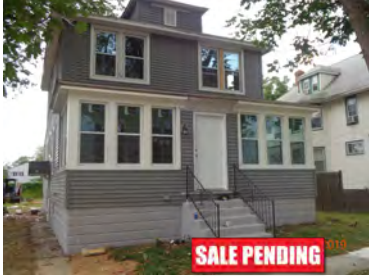
211 N. 42nd St. 3 Bed/1.5 Bath 1,476 sq. ft. East Camden