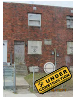
921 N. 22nd St. 3 Bed/1.5 Bath 1,155 sq. ft. Cramer Hill