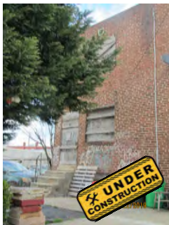
932 N. 21st St. 3 Bed/1.5 Bath 1,155 sq. ft. Cramer Hill