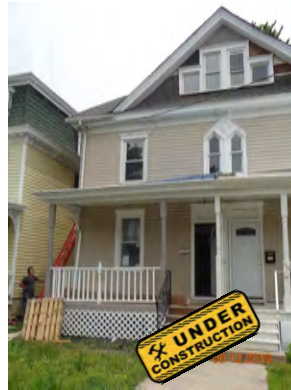
66 E. Centre St. 4 Bed/1.5 Bath 1,574 sq. ft. Woodbury