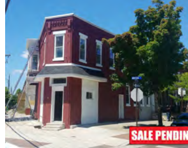
466 Trenton Ave. 3 Bed/2.5 Bath 1,800 sq. ft. Cooper Plaza