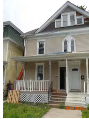
66 E. Centre St. 4 Bed/1.5 Bath 1,574 sq. ft. Woodbury