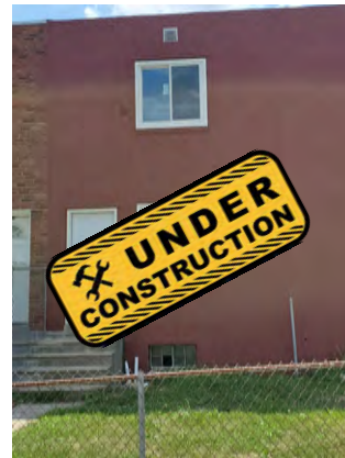
921 N. 22nd St. 3 Bed/1.5 Bath 1,155 sq. ft. Cramer Hill