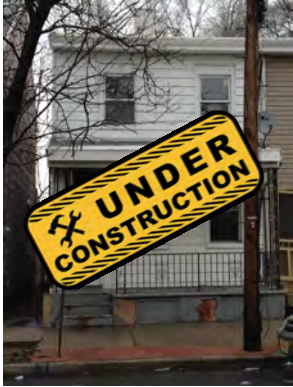
409 Market St. 3 Bed/1.5 Bath 1,435 sq. ft. Gloucester City