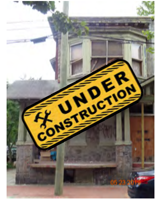
724 Washington St. 3 Bed/2.5 Bath 1,765 sq. ft. Cooper Plaza