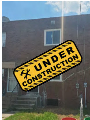
932 N. 21st St. 3 Bed/1.5 Bath 1,155 sq. ft. Cramer Hill