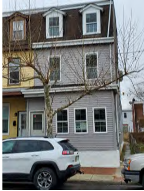
228 Market St. 5 Bed/1.5 Bath 2,076 sq. ft. Gloucester City