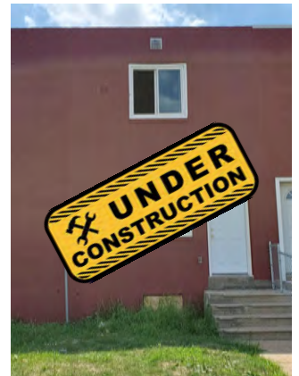
923 N. 22nd St. 3 Bed/1.5 Bath 1,155 sq. ft. Cramer Hill

Call today for pricing and availability!