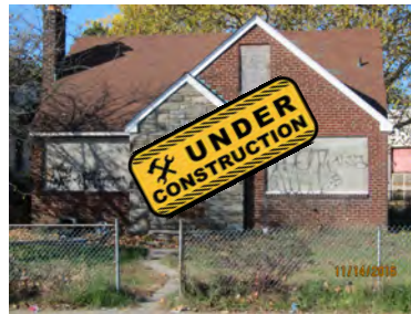
2631 Baird Blvd. 4 Bed/2 Bath 1,593 sq. ft. East Camden