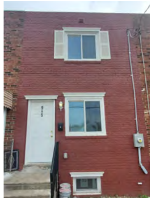
905 N. 22nd St. 3 Bed/1.5 Bath 1,155 sq. ft. Cramer Hill