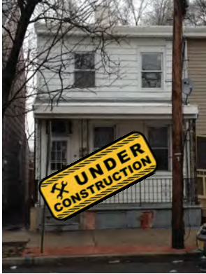
409 Market St. 3 Bed/1.5 Bath 1,435 sq. ft. Gloucester City