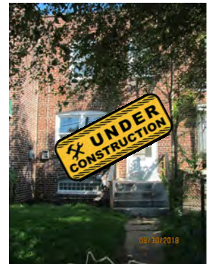
2905 Royden St. 3 Bed/1.5 Bath 1,317 sq. ft. East Camden

Call today for pricing and availability!