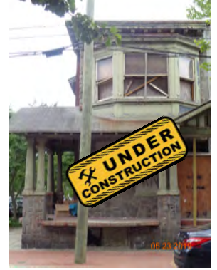
724 Washington St. 3 Bed/2.5 Bath 1,765 sq. ft. Cooper Plaza