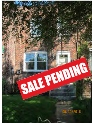
2905 Royden St. 3 Bed/1.5 Bath 1,317 sq. ft. East Camden