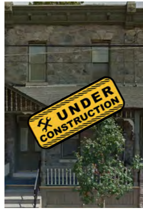
722 Washington St. 3 Bed/1.5 Bath 1,180 sq. ft. Cooper Plaza