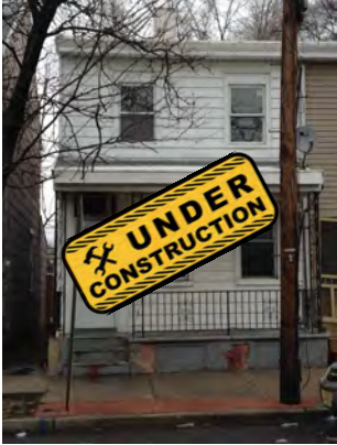
409 Market St. 3 Bed/1.5 Bath 1,435 sq. ft. Gloucester City