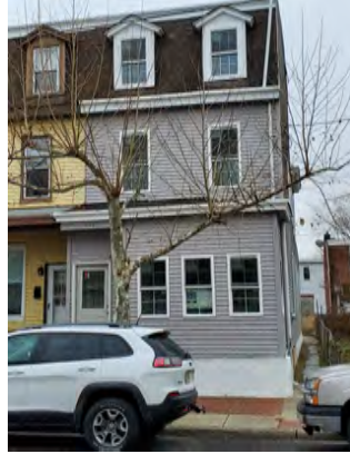
228 Market St. 5 Bed/1.5 Bath 2,076 sq. ft. Gloucester City