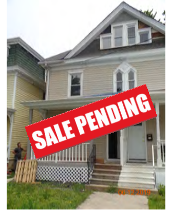
66 E. Centre St. 4 Bed/1.5 Bath 1,574 sq. ft. Woodbury