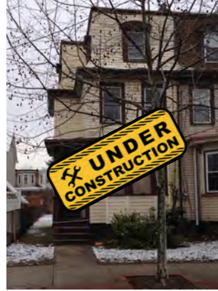
320 Market St. 3 Bed/2.5 Bath 1,600 sq. ft. Gloucester City