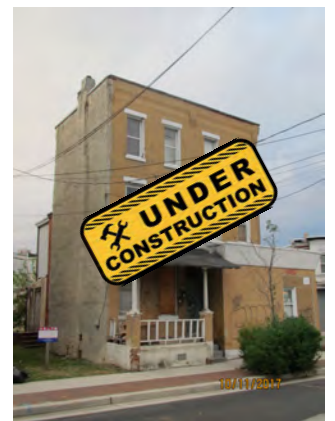
503 Newton Ave. 3 Bed/2.5 Bath 1,966 sq. ft. Cooper Plaza

Call today for pricing and availability!