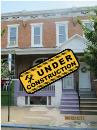
18 N. 28th St. 3 Bed/1.5 Bath 1,100 sq. ft. East Camden